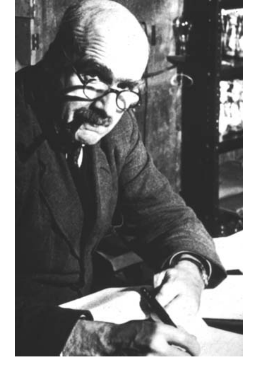
J.B.S. HALDANE Model Corpsman, 1957