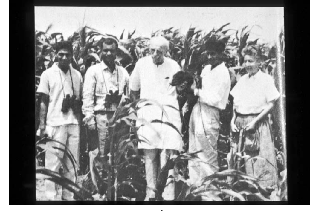
JBS in India