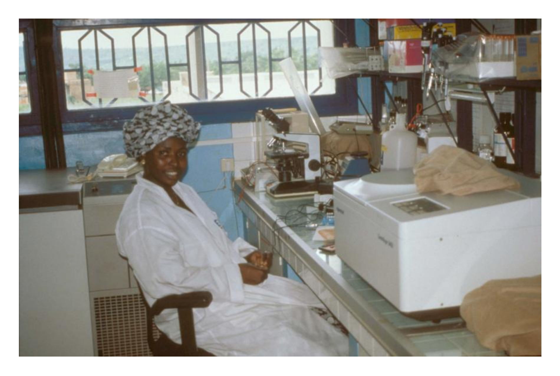
Malian graduate students use advanced technology