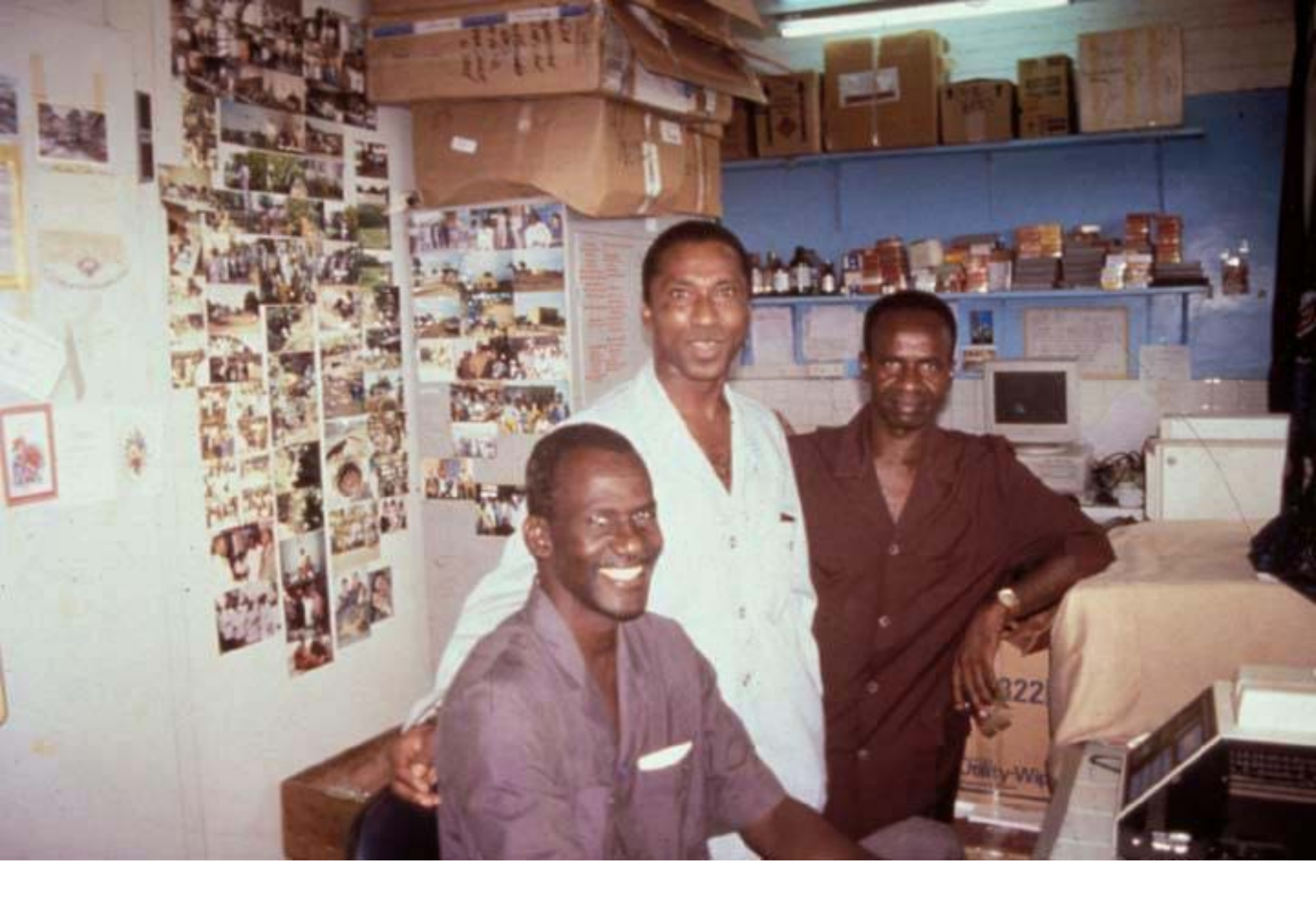
Malian entomologists at the MRTC in Bamako